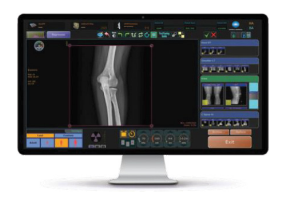
Proprietary software eliminates the need to toggle between screens, streamlining workflow.